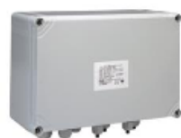
Power supply Unit 9.3389.10.010

For the power supply of wind speed transmitters, wind direction transmitters or combined instruments.