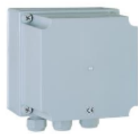
Power Supply Unit 9.3388.00.000

Provides power, for Ombrometer and Precipitation Transmitter.