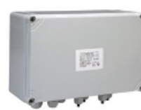
Power supply Unit 9.3389.10.000

For the power supply of wind speed transmitters, wind direction transmitters or combined instruments.